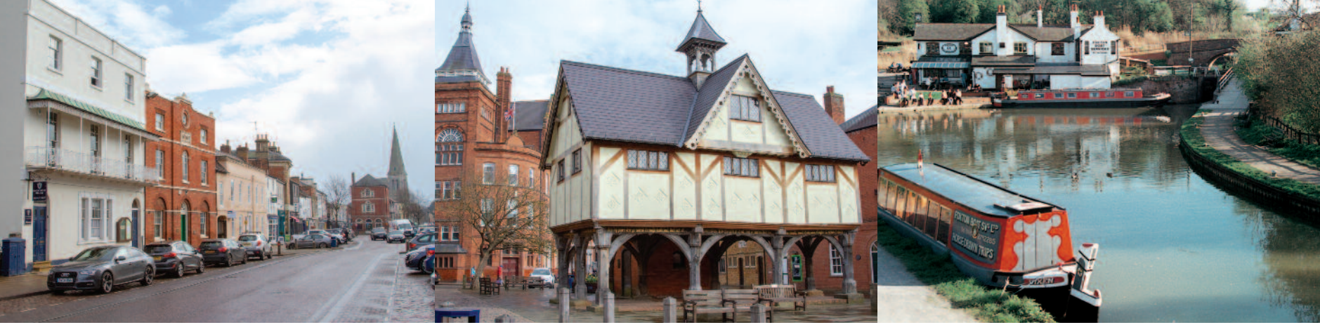
High Street, The Old Town Hall & St Dionysius Church